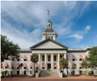
FL Capital Bldg.—Tallahassee

CALL'S Florida Community Association Legislative Guide 2018 is now available. The Guide is applicable to all 3 types of shared-ownership communities (condominiums, cooperatives, and homeowners' associations).